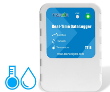
Logging and transmitting Temp & RH data