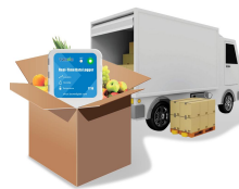
Put into the box/carton