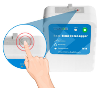
Press the button to start