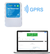
Access cloud platform to check data